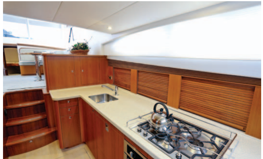
Above: The flybridge helmstation has plenty of room for passengers to enjoy the views from the top. Above right: The galley, on lower level to starboard, has 3.2m of bench space and generous stowage

we're travelling at night, eliminating any light from below. I do a lot of steaming at night, to get out to the fishing grounds early or heading away for a weekend."