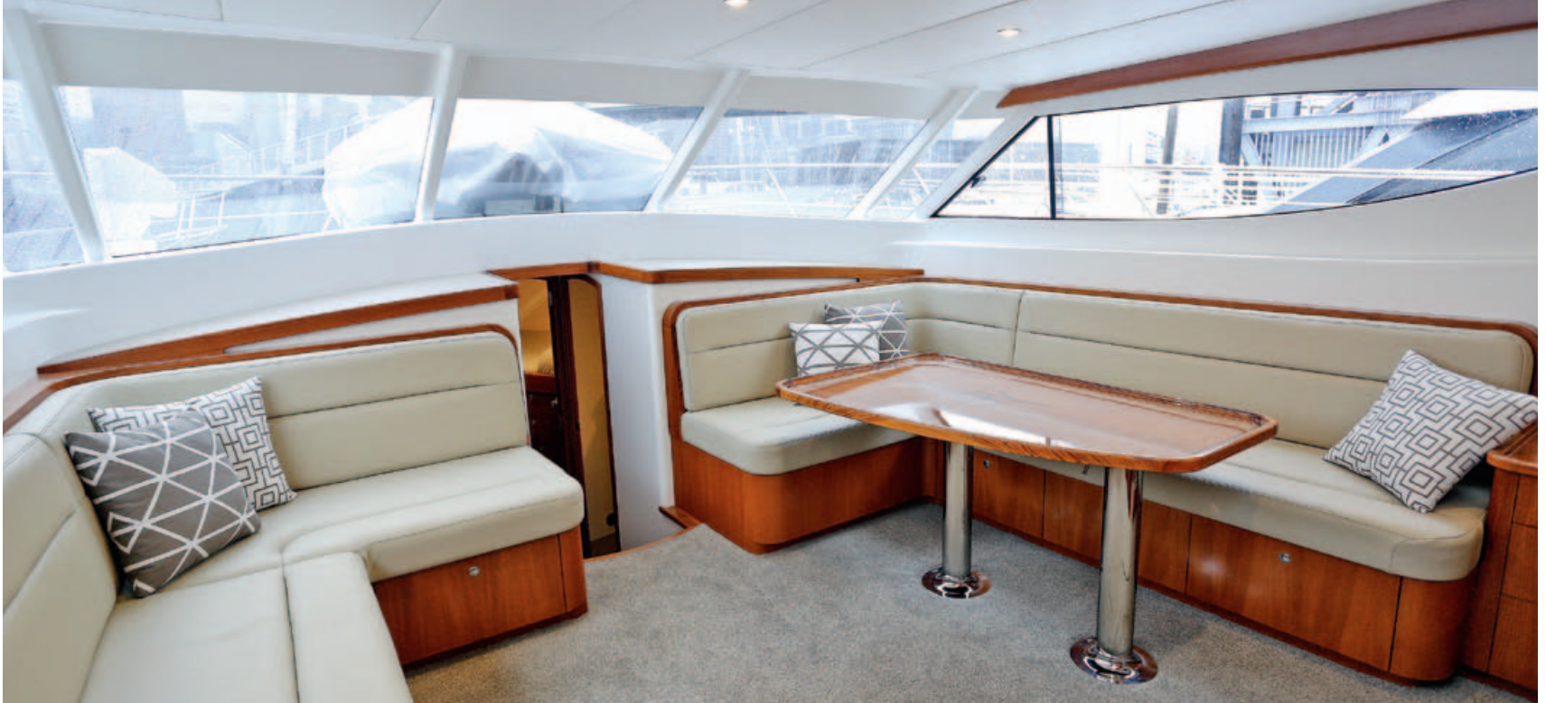
The spacious saloon resides at a level midway between the galley and the flybridge, achieving an overall lower profile. This is the quintessential element of Upfold's mid-pilothouse design