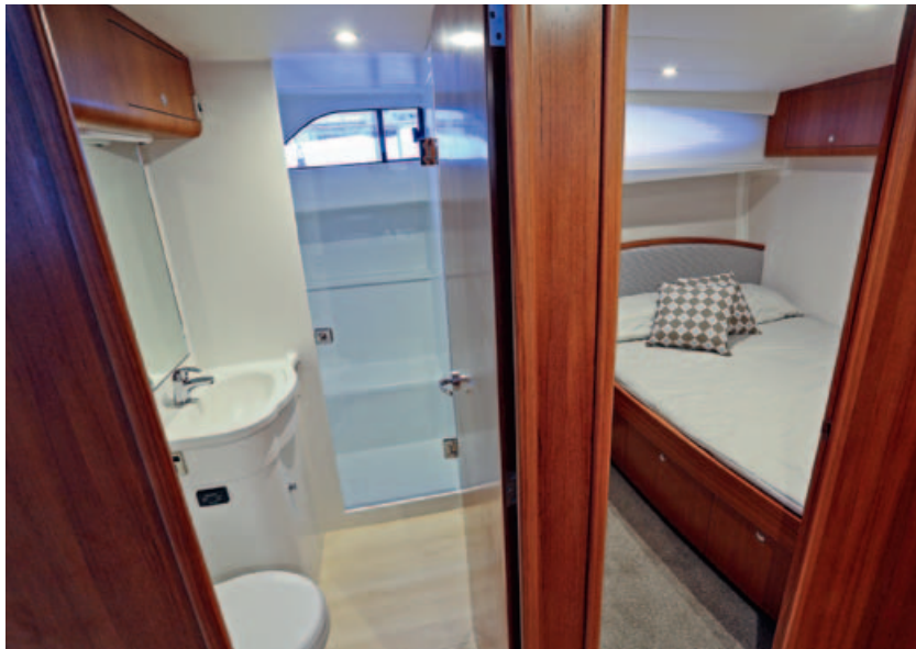
A double cabin with ensuite on the lower level, to port, opposite the galley

less windage and a generally more pleasing profile. Access to the flybridge is via an internal stairway from the saloon or by a second stair from the cockpit. Like the rest of the boat, the flybridge is diesel-heated, but there's no air-conditioning.