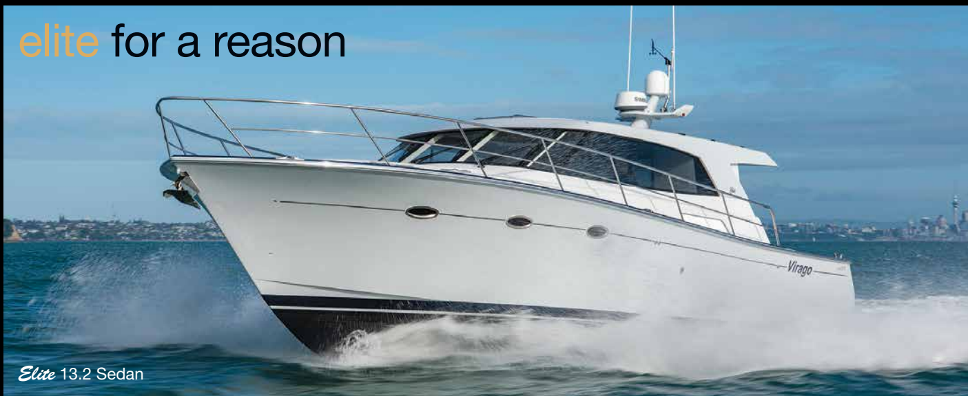
Elite 13.2 Sedan