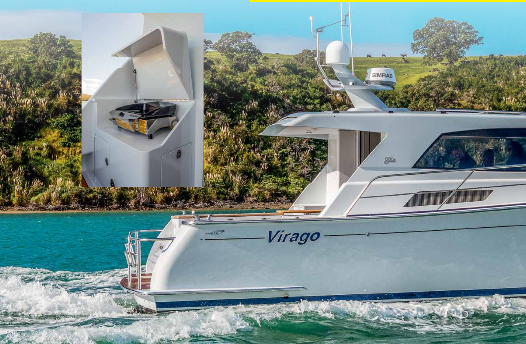
BELOW LEFT The discreetly-positioned but accessible BBQ.