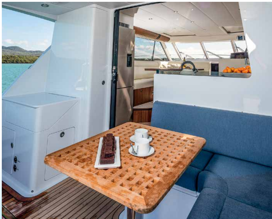
ABOVE Coffee and brownies, anyone?

Virago has bow and stern thrusters to emulate the manoeuvrability of a twin-screw setup, as demonstrated by